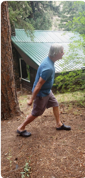
2020 looking for another ringer