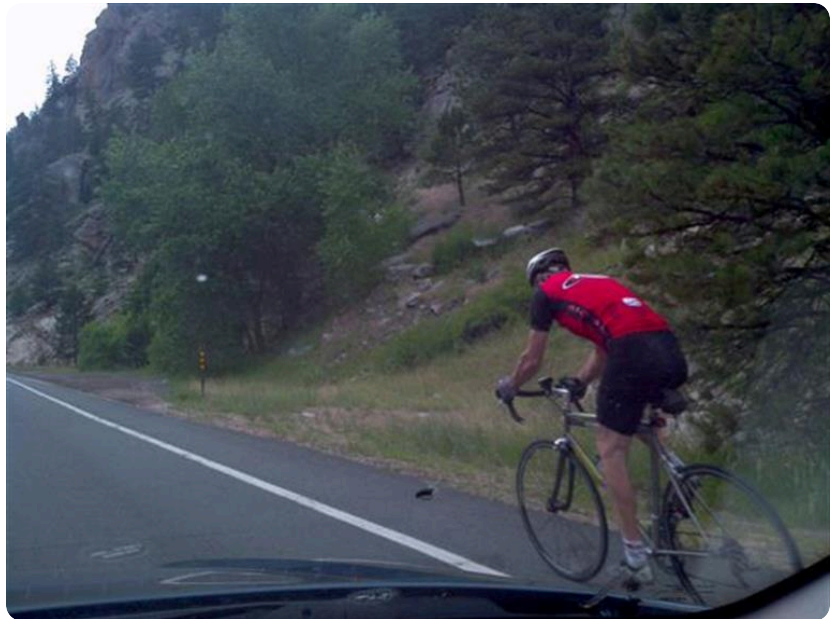
Commuting to work